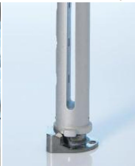
closing mechanism and door hold open function integrated in lower hinge